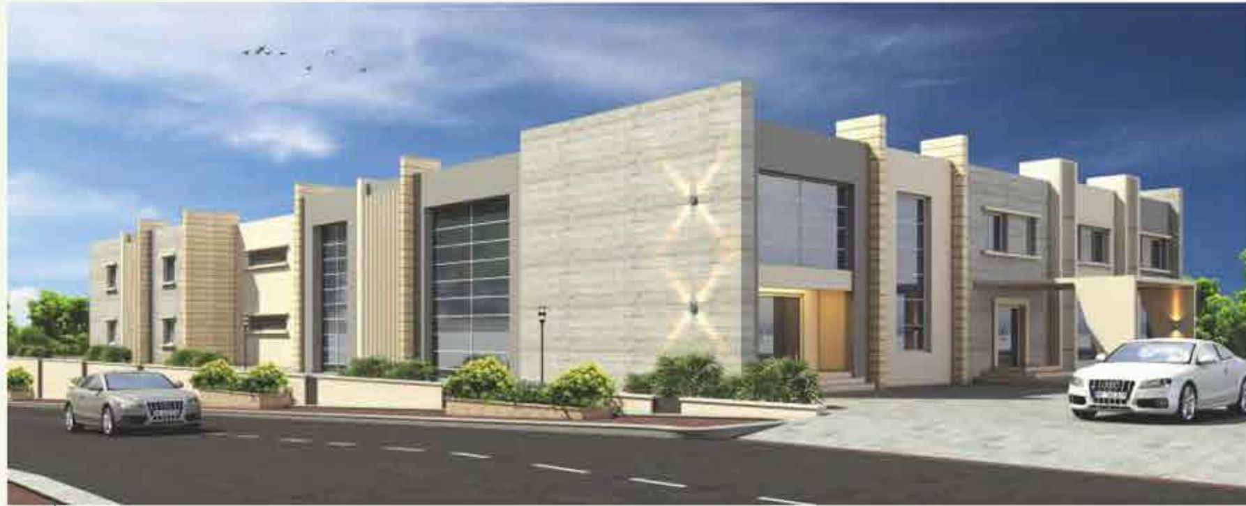
MULTI STOREY LUXURY CLUBHOUSE