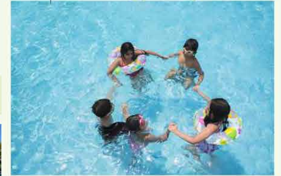
SWIMMING POOL WITH DECK & KIDS POOL